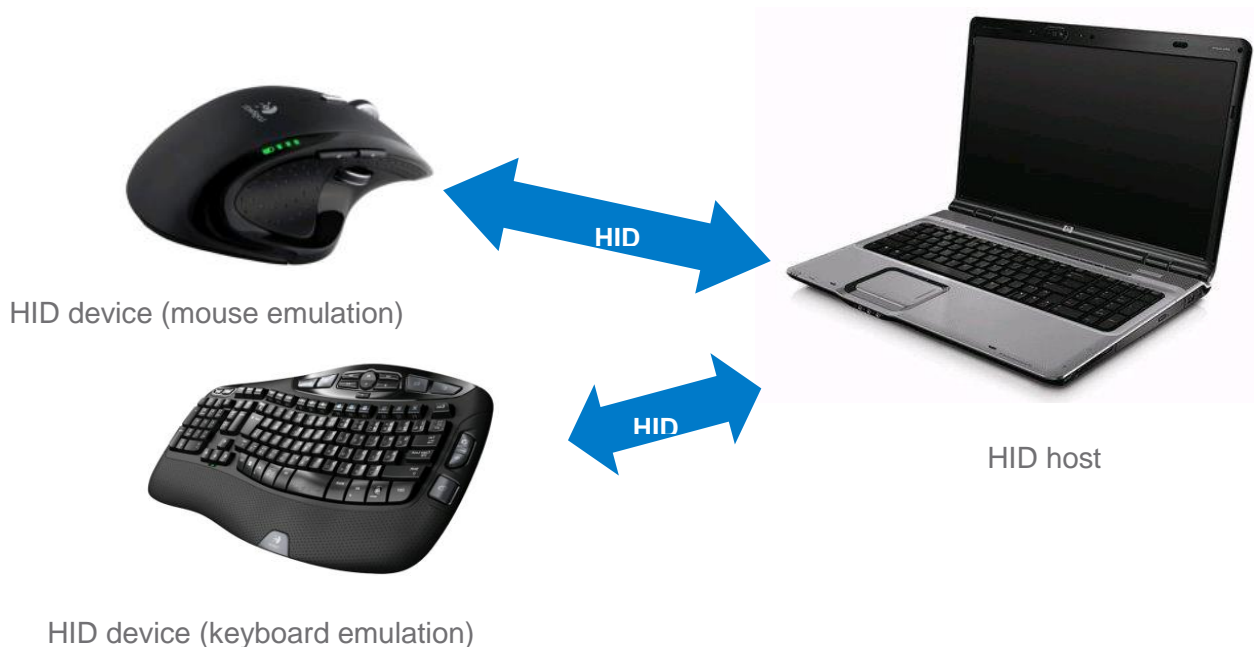
Figure 1: Typical HID use case

The Bluetooth HID profile is built upon the Generic Access Profile (GAP), specified in the Bluetooth Profiles Document; see Referenced Documents [1]. In order to provide the simplest possible implementation, the HID protocol runs natively on L2CAP and does not reuse Bluetooth protocols other than the Service Discovery Protocol.